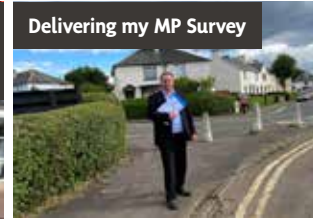
Delivering my MP Survey