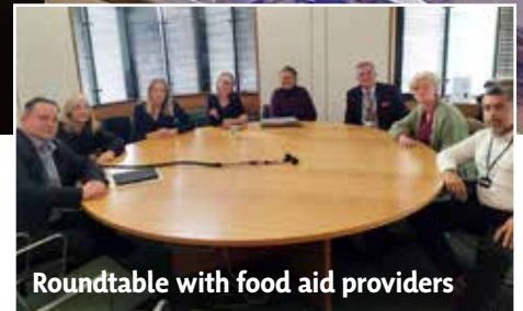
Roundtable with food aid providers

My aim is to ensure affordable food is accessible in all areas throughout Glasgow