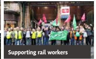
Supporting rail workers