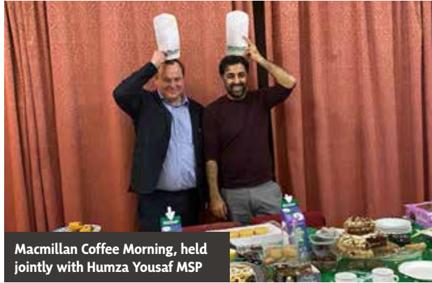
Macmillan Coffee Morning, held jointly with Humza Yousaf MSP

I have also held surgeries throughout the constituency each week, plus much more!