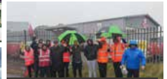
Supporting Royal Mail workers