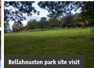
Bellahouston park site visit