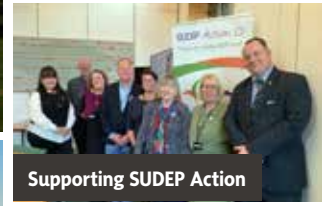
Supporting SUDEP Action