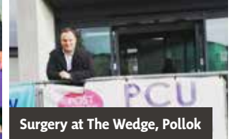
Surgery at The Wedge, Pollok