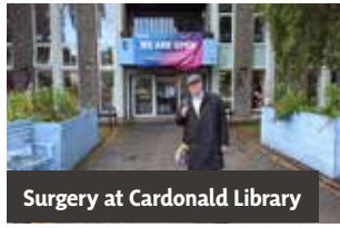
Surgery at Cardonald Library